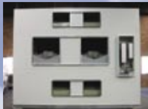
Australian Institute of Sport Air Handling Unit 12,000 L/s with Hot/Cold Water coils and return air bypass