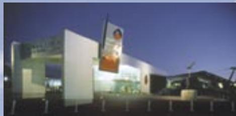
Australian Institute of Sport