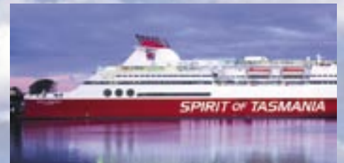
Spirit of Tasmania Trans-Tasman Line Terminal