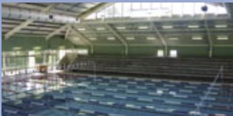
St Ignatius Riverview College

Sensible heat exchanger transfers temperature only (HRV).